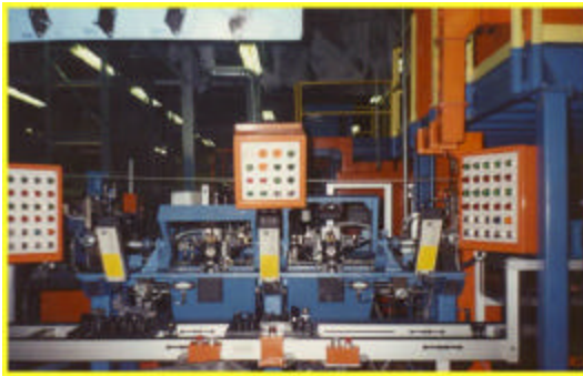
Typical automated process